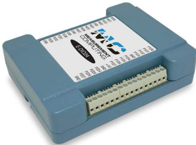
The E-DIO24 provides 24 lines of digital I/O with \pm 24 mA drive capability