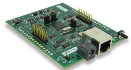
The E-DIO24-OEM has the same specifications as the standard device

The E-DIO24-OEM has a board-only form factor with header connectors for OEM and embedded applications (no case, CD, or Ethernet cable). The device can be further customized to meet customer needs.