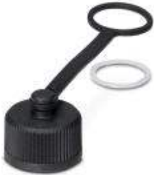
M12 sealing cap made of plastic with fixing band, for free M12 plugs with 14.5 mm fastening eye

Please be informed that the data shown in this PDF Document is generated from our Online Catalog. Please find the complete data in the user's documentation. Our General Terms of Use for Downloads are valid ( http://download.phoenixcontact.com )