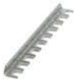
Fixed bridge, Number of positions: 10, Color: silver

Please be informed that the data shown in this PDF Document is generated from our Online Catalog. Please find the complete data in the user's documentation. Our General Terms of Use for Downloads are valid ( http://phoenixcontact.com/download )