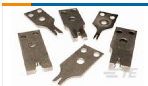
TE Part #2-456134-5 CRIMPER, INSULATION "F"(.200")