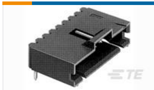
TE Part #5-104935-7 06 MTE HDR SRRRA LTCH.100CL LF