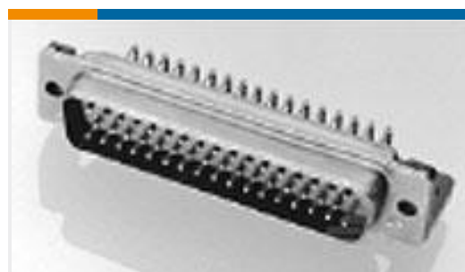
TE Part #1218440-5 AMPLIMITE,ASY,PLUG,RT ANG,109,5