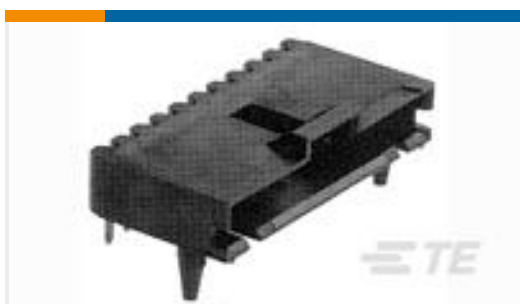
TE Part #5-104361-8 09 MTE HDR SRRRA LATCH W/HLDWN