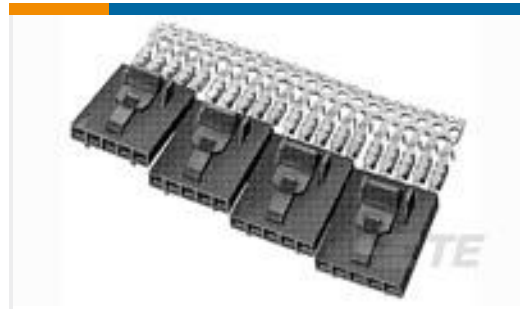
TE Part # 5-103961-1 10X2 MTE RCPT SR LATCH .100CL