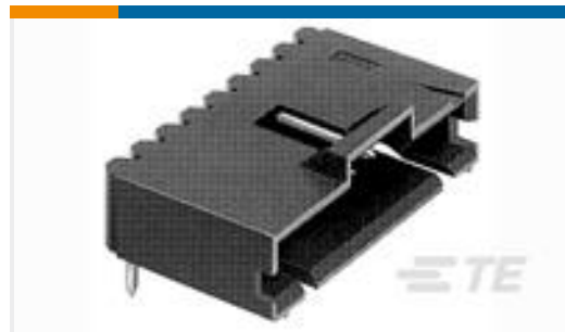
TE Part #6-104935-0 10 MTE HDR SRRRA LTCH.100CL LF