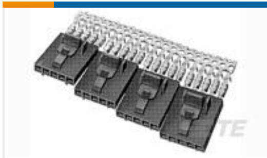
TE Part # 5-103958-1 10X2 MTE RPT SR LATCH .100CL