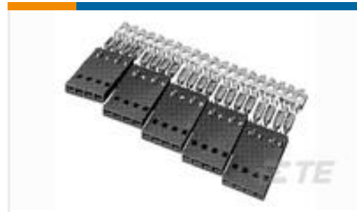
TE Part # 5-103973-1 10X2 MTE RCPT SR RIBBED .100CL