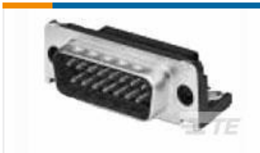
TE Part #5747236-2 15 MSFL PLUG RA 318 (FM)