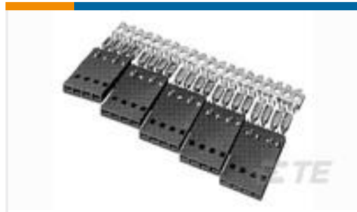
TE Part # 5-103970-1 10X2 MTE RCPT SR RIBBED .100CL