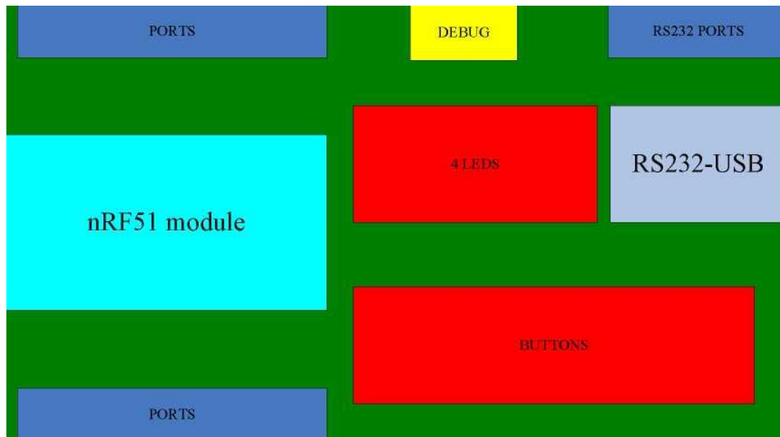
nRF51-DK functional blocks