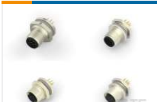
TE Part #T4141012041-000 M12 Panel Mount PCB