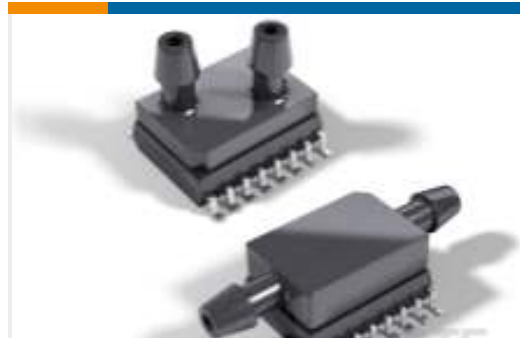
TE Part #6331-BCE-S-004-000 Low Pressure Digital / Analog Sensor