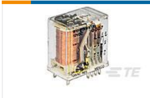
TE Part #1-1393766-7 R10-E1X4-V700=R10