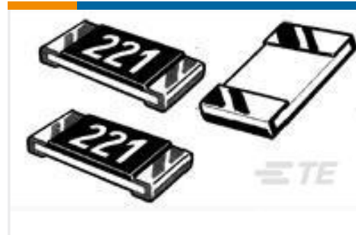
TE Part #8-2176230-6 3522 10M 5% 3W