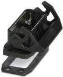
HEAVYCON EVO panel mounting base, plastic, D15, with single locking latch, with flat gasket

Please be informed that the data shown in this PDF Document is generated from our Online Catalog. Please find the complete data in the user's documentation. Our General Terms of Use for Downloads are valid ( http://phoenixcontact.com/download )