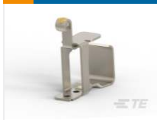
TE Part # 2388202-2 Shield Finger, 3.8mm