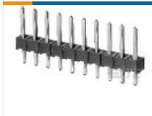
TE Part #5-146281-3 03 MODII HDR SRST B/A LF