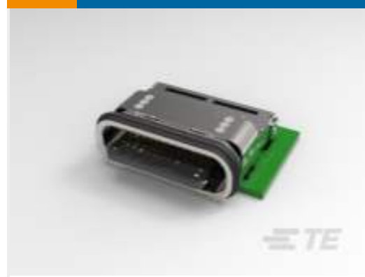
TE Part # 2305018-2 USB TYPE C, REC IPX8 ON BOARD DUAL SMT