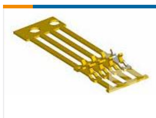
TE Part #1544223-1 CONTACT 718 MODIFI