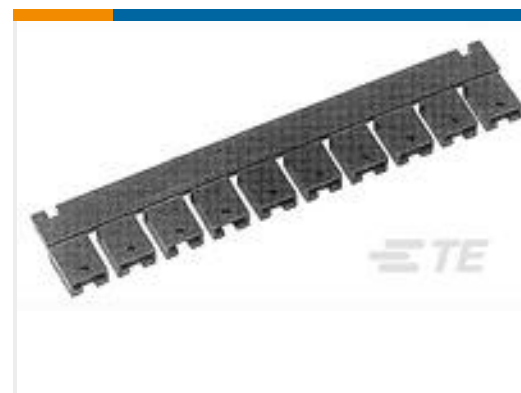
TE Part #382811-6 SHUNT, ECON, PHBR 15 AU,BLACK