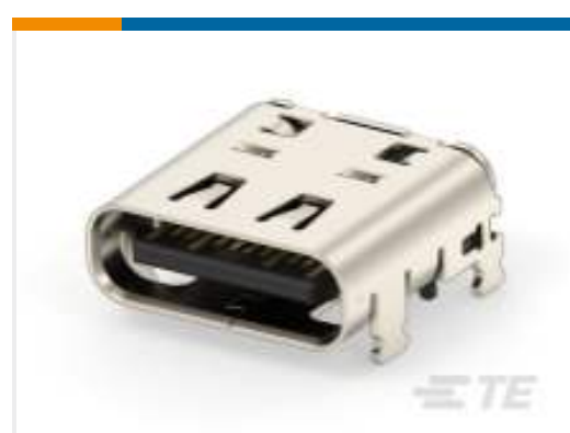
TE Part #2385692-1 USB4 RECPTACLE ON BOARD