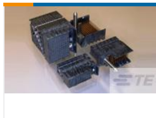
TE Part #2007820-1 IMP100S,H,V4P10C,UG,OEW39,4.5