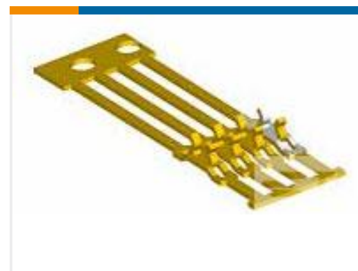
TE Part #1544301-2 CONTACT A SOUDER