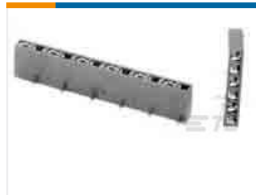
TE Part #1241152-5 5P HV100 REC. CON, SMD, GOLD, BLISTER