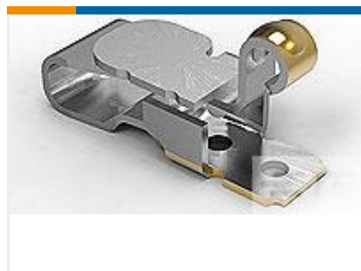
TE Part #1551572-5 Shield Finger, Loose Piece