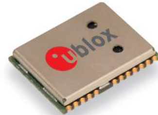
NEO-6P: 12.2 x 16.0 x 2.4 mm