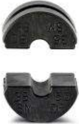
The figure shows the ...R35-50/DIE version

pre-round die (pair), for CRIMPFOX-C50, for sector cable 25 + 35 mm 2