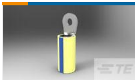
TE Part #53054 TERMINAL, PIDG R IR 24 4