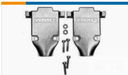
TE Part #5745173-4 CABLE CLAMP KIT, SZ 3