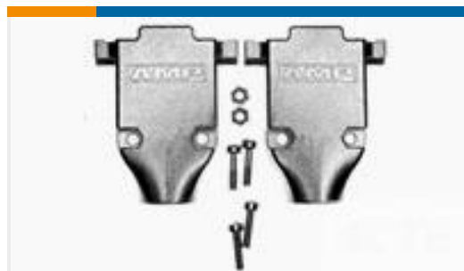
TE Part #5747100-3 CABLE CLAMP KIT, SZ 4