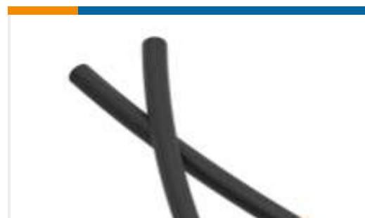
TE Part #NB24322001 TAT-125-3/8-0-STK