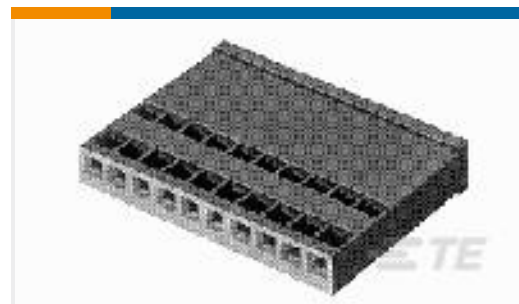
TE Part #1-87175-4 06 LOCKING CLIP HSG SR .100CL