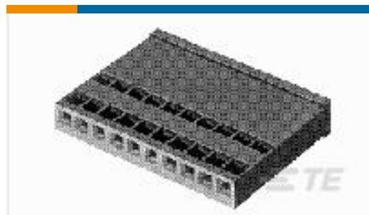
TE Part #1-87175-2 05 LOCKING CLIP HSG SR .100CL