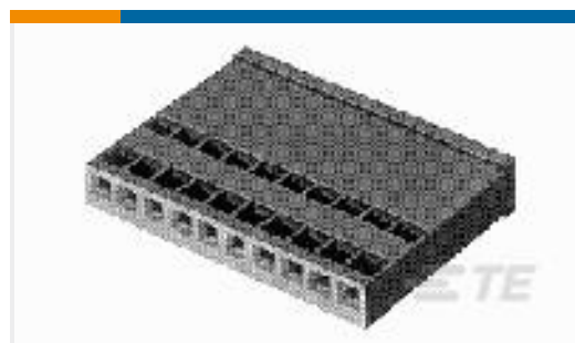
TE Part #87175-8 03 LOCKING CLIP HSG SR .100CL