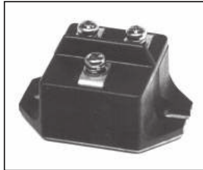
CN24__500N, CC24__500N Super Fast Recovery Dual Diode Modules 50 Amperes/300-600 Volts