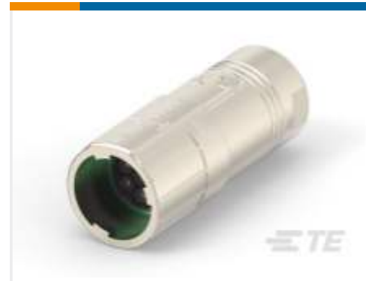
TE Part #BSA880N0086055A000 917 PLUG, SPEEDTEC