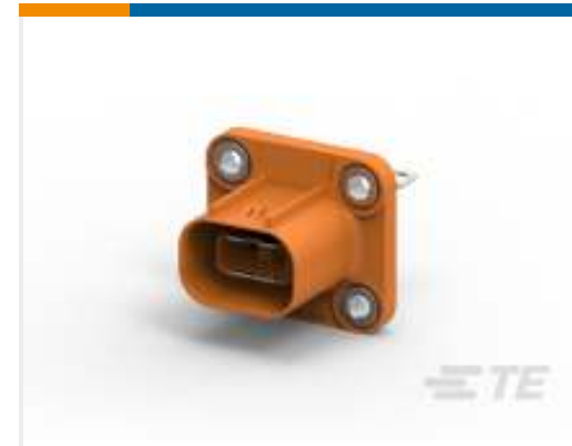
TE Part #2229745-1 HVA280 HEADER ASSY, KEY A, ORANGE