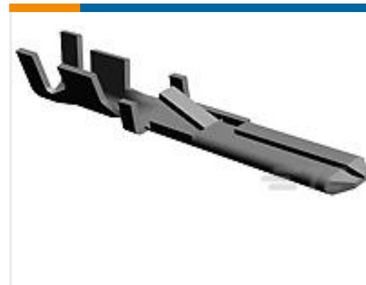
TE Part #928794-2 FF 110 TAB PTP CUZN30