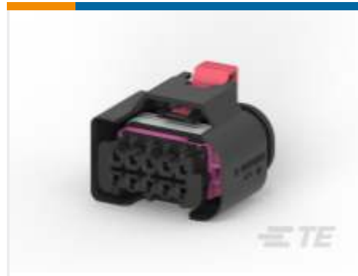
TE Part #1-2282337-5 10POS, MCON 1.2 LL REC SEALED 2ROW