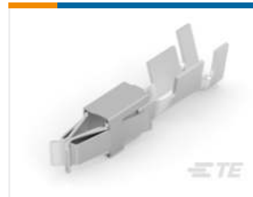
TE Part #927777-3 JUNIOR POWER TIMER CONTACT