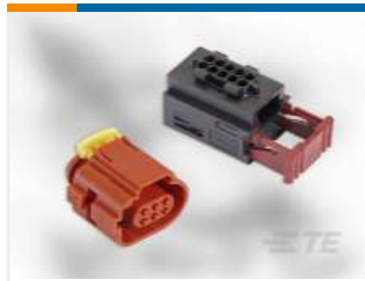
TE Part #929505-7 Timer Connector Housing