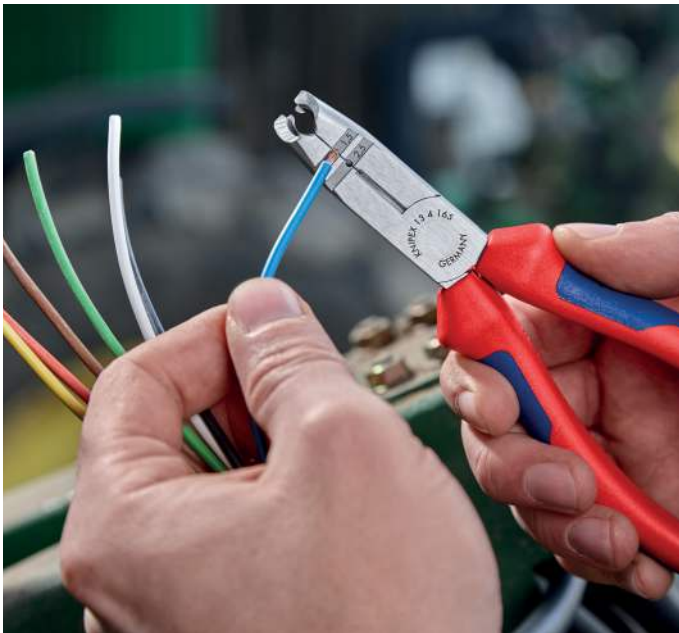
Wire stripping holes for 1.5 and 2.5 mm 2 conductors