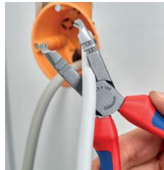
Cutting cable up to Ø 13 mm