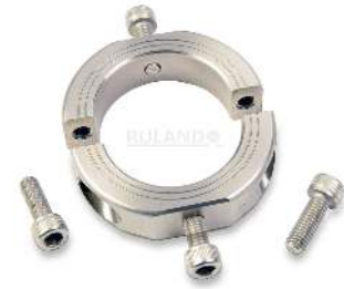
*Additional hardware NOT included