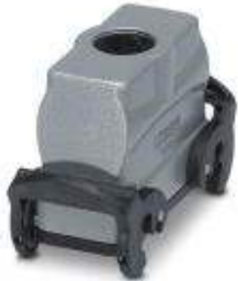
HEAVYCON B16 coupling housing, with double locking latch, height: 82 mm, with 1 x M32 thread, straight cable outlet

Please be informed that the data shown in this PDF Document is generated from our Online Catalog. Please find the complete data in the user's documentation. Our General Terms of Use for Downloads are valid ( http://phoenixcontact.com/download )