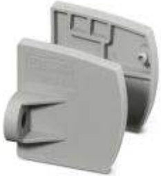
Flange cover, Color: gray

Please be informed that the data shown in this PDF Document is generated from our Online Catalog. Please find the complete data in the user's documentation. Our General Terms of Use for Downloads are valid ( http://download.phoenixcontact.com )