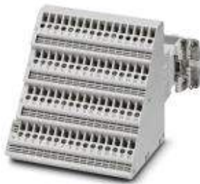
HEAVYCON terminal adapter female insert, D64 series, 64-pos., left protective conductor connection for the right side of the control cabinet, screw connection

Please be informed that the data shown in this PDF Document is generated from our Online Catalog. Please find the complete data in the user's documentation. Our General Terms of Use for Downloads are valid ( http://download.phoenixcontact.com )