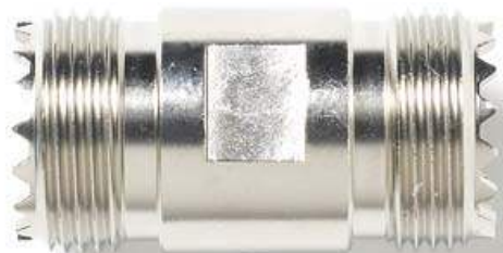
Model 73058 UHF Jack to Jack Adapter