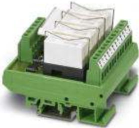
VARIOFACE module, for 4 plug-in miniature relays or miniature optocouplers, with LED, 24 V AC/DC input voltage

Please be informed that the data shown in this PDF Document is generated from our Online Catalog. Please find the complete data in the user's documentation. Our General Terms of Use for Downloads are valid ( http://phoenixcontact.com/download )