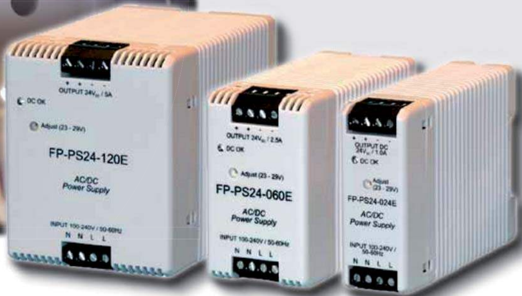
FP-PS24-120E 5.0A/24V DC