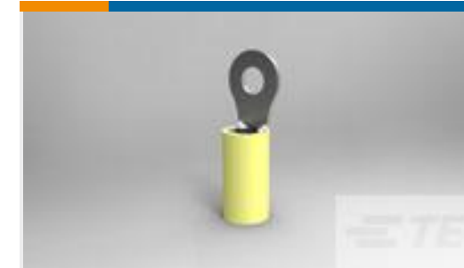
TE Part #35108 TERMINAL,PIDG R 12-10 8