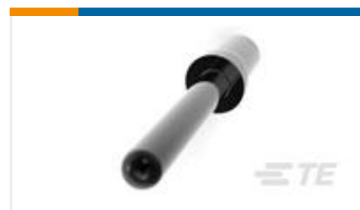
TE Part #1766193-1 CONTACT,PIN,SIZE #12