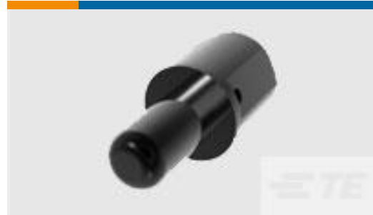
TE Part #1766274-1 CONTACT,PIN,#0