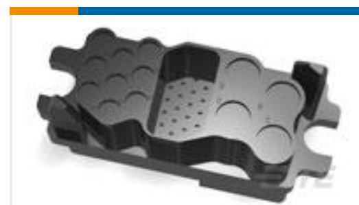
TE Part #1648162-1 261-0006-01100