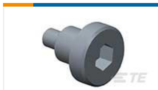
TE Part #1650402-1 902-83-02113=SCREW,SHLDR,8-32