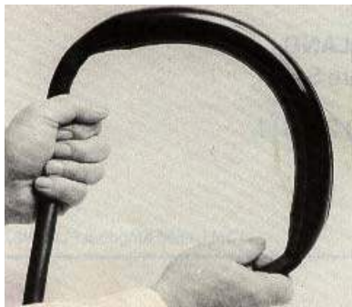
Excellent flexibility in completed joint.