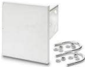
Flat panel antenna, 5 GHz, gain 18 dBi, connection N (female), IP55

Please be informed that the data shown in this PDF Document is generated from our Online Catalog. Please find the complete data in the user's documentation. Our General Terms of Use for Downloads are valid ( http://download.phoenixcontact.com )