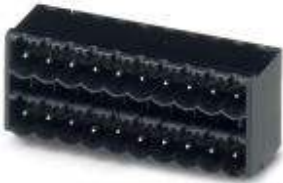
The figure shows a 10-pos. version with 20 contacts

Header, Nominal current: 12 A, Rated voltage (III/2): 400 V, Number of positions: 10, Pitch: 5.08 mm, Color: black, Contact surface: Tin, Assembly: Taped SMD/THT/THR components