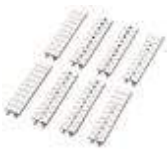
Zack marker strip, Can be ordered: Strip, white, Labeled according to customer specifications, Mounting type: Snap into tall marker groove, For terminal block width: 3.5 mm, Lettering field: 3.5 x 10.5 mm

Zack marker strip - ZB 3,5 CUS - 0829415