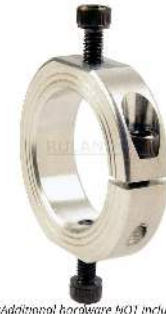
*Additional hardware #101 included