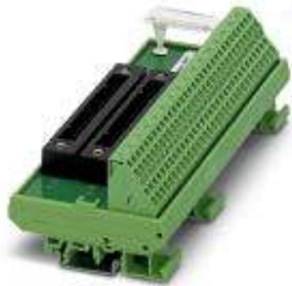
VARIOFACE interface module with screw connection, for Yokogawa RTD module AAR145.

Please be informed that the data shown in this PDF Document is generated from our Online Catalog. Please find the complete data in the user's documentation. Our General Terms of Use for Downloads are valid ( http://phoenixcontact.com/download )