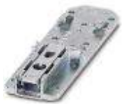
Universal DIN rail adapter

Assembly adapters - UTA 107/30 - 2320089