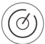
Auto On / Off