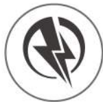
ZEN+ 2.0 Adaptive Charging