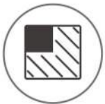
Compact & Superior Portability