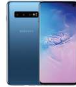
Samsung Galaxy S10