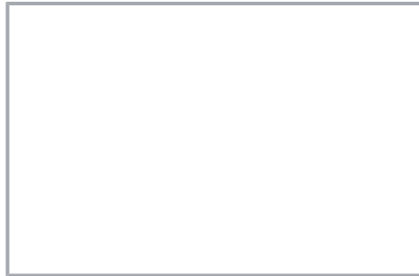
Snapping a marking strip into the marker slot.