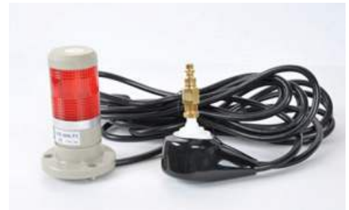
Adjustable Airline Monitor