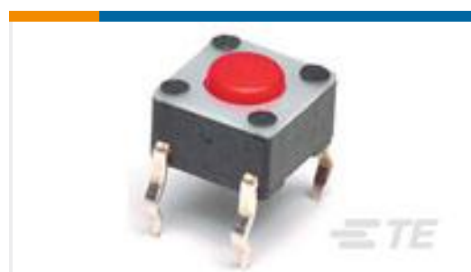
TE Part #1825910-6 FSM4JH=6MM TACT SWITCH, HIGH TEMP