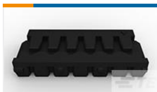
TE Part #1909783-5 WIRE TO BOARD HOUSING 1.2MM TOP ENTRY