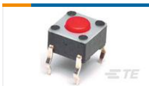
TE Part #1825910-7 FSM4JAH=6MM TACT SWITCH, HIGH TEMP