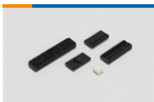
Wire-to-Board Connector Assemblies &amp; Housings(5)