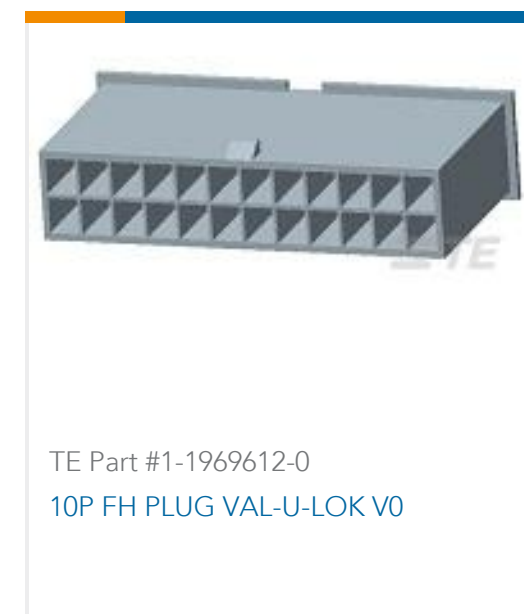
TE Part #1-1969612-0 10P FH PLUG VAL-U-LOK V0