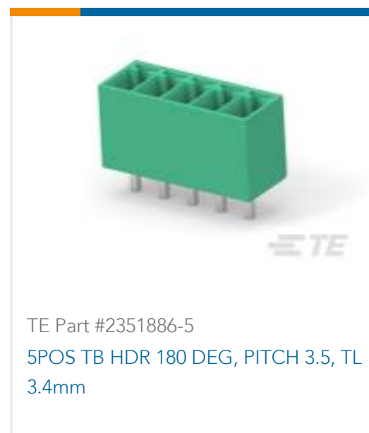
TE Part #2351886-5 5POS TB HDR 180 DEG, PITCH 3.5, TL 3.4mm