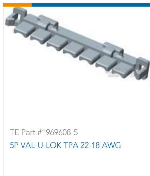
TE Part #1969608-5 5P VAL-U-LOK TPA 22-18 AWG