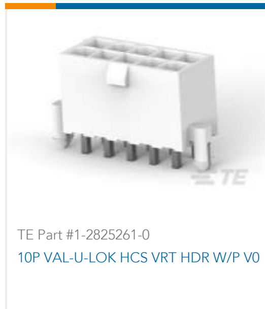
TE Part #1-2825261-0 10P VAL-U-LOK HCS VRT HDR W/P V0