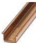
DIN rail, material: Copper, unperforated, 1.5 mm thick, height 15 mm, width 35 mm, length: 2 m

DIN rail, unperforated - NS 35/15 CU UNPERF 2000MM - 1201895