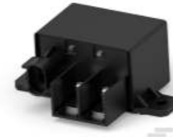
TE Part #5-1414968-1 V23132B2002B200-EV-USBX