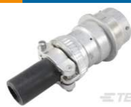
TE Part #HD34-24-9SN-059 REC,9P,AL,N, CBLCLMPBT,DRAIN,4/8 /12,S,MC