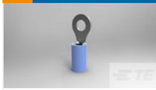
TE Part #51864-5 TERMINAL,PIDG R 16-14 8