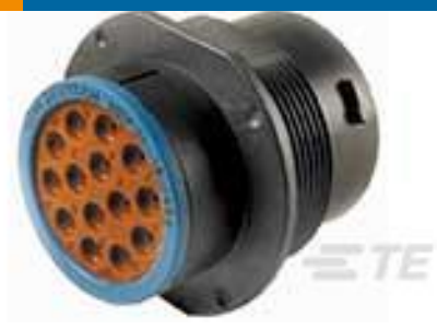
TE Part #HDP24-18-14SE REC, 14P, BLK, E, 16, S