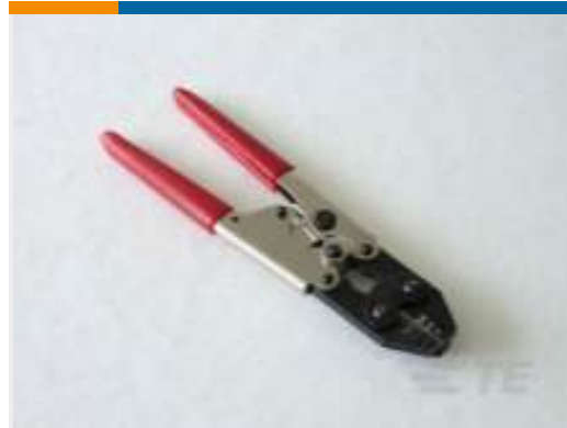
TE Part #992008-000 AD-1377-CRIMP-TOOL-3-CVTY