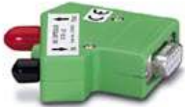
INTERBUS fiber optic adapter, for converting the remote IN interface to fiber optic, FO output left

Please be informed that the data shown in this PDF Document is generated from our Online Catalog. Please find the complete data in the user's documentation. Our General Terms of Use for Downloads are valid ( http://phoenixcontact.com/download )