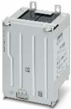
Energy storage, VRLA-AGM, 24 V DC, 7 Ah, automatic detection and communication with QUINT UPS-IQ

Please be informed that the data shown in this PDF Document is generated from our Online Catalog. Please find the complete data in the user's documentation. Our General Terms of Use for Downloads are valid ( http://phoenixcontact.com/download )