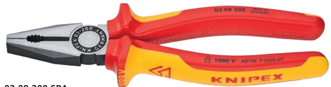
03 08 200 SBA