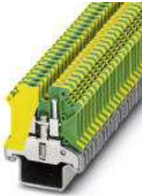
Ground modular terminal block, Connection method: Screw connection, Cross section: 0.2 mm 2 - 6 mm 2 , AWG 24 - 10, Width: 6.2 mm, Color: green-yellow, Mounting type: NS 35/15-2,3

Please be informed that the data shown in this PDF Document is generated from our Online Catalog. Please find the complete data in the user's documentation. Our General Terms of Use for Downloads are valid ( http://download.phoenixcontact.com )