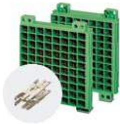
Connection honeycomb, Connection type: Screw mounting, Number of positions: 80, Color: green

Please be informed that the data shown in this PDF Document is generated from our Online Catalog. Please find the complete data in the user's documentation. Our General Terms of Use for Downloads are valid ( http://download.phoenixcontact.com )