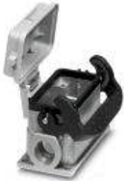
HEAVYCON box mounting base B10, with double locking latch, height 52 mm, with supports 2xM25 and protective cover

Please be informed that the data shown in this PDF Document is generated from our Online Catalog. Please find the complete data in the user's documentation. Our General Terms of Use for Downloads are valid ( http://download.phoenixcontact.com )