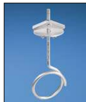
Integrated Toggle Screw