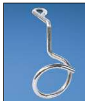
User Supplied Nail or Fastener