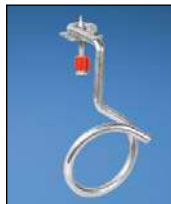
Power Actuated Fastener