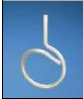
Non-Threaded #8 Wire