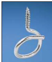
Wood Screw Thread