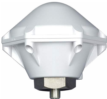
Model AS0099200 GNSS Antenna

Both active antenna and in-line preamplifier are compatible with existing and proposed L1-band Global Navigation Satellite Systems (GNSS), including GPS, GLONASS, and Galileo; and L1-band Satellite Based Augmentation Systems (SBAS) such as WAAS, EGNOS, and MSAS.