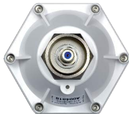
Status LED and Sealed Connector