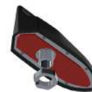
Bolt Mount with Adhesive Pad

The MULTIMAX FV antenna builds on the best in class RF performance, leading design features, and extended operational life of our highly successful Fleet and Public Safety Antenna products. This new product line also offers a rugged low-profile design which gives you greater protection against all the natural hazards a vehicle faces including vibration, hot, cold, ice, salt, dirt, car washes, and tree branch sweeps. Our antennas typically outlast the life of a vehicle.