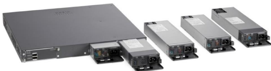
Figure 2. Cisco Catalyst 2960-XR Series power supply

Dual redundant power supplies are supported on the Cisco Catalyst 2960-XR Series Switches. These switches ship with one power supply by default. The second power supply can be purchased at the time of ordering the switch or as a spare. These power supplies have built-in fans to provide cooling (Figure 2).