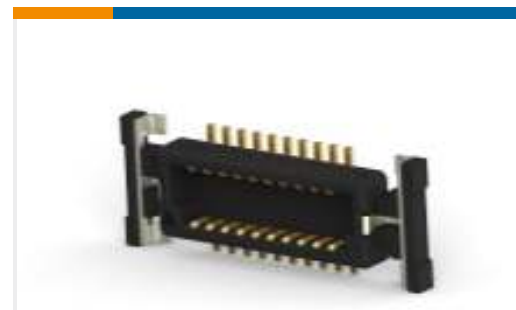
TE Part #2-5353515-0 ON TAPING (EMBOSS) 0.5MM FS CONN. TAB AS