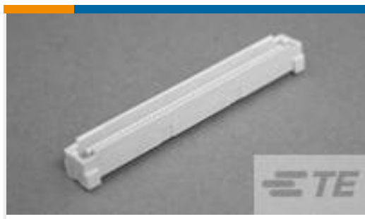
TE Part #1-5177986-2 0.8FH,P06H.5,060,08/Sn,TR,SC