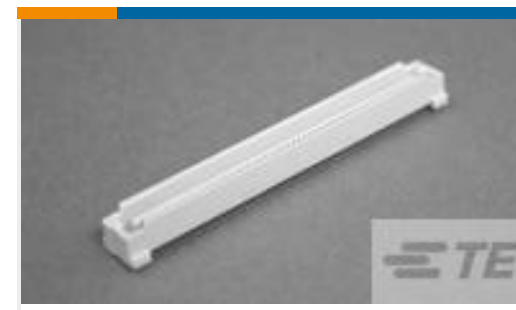
TE Part #5177984-1 0.8FH,P05H.5,040,08/Sn,TU