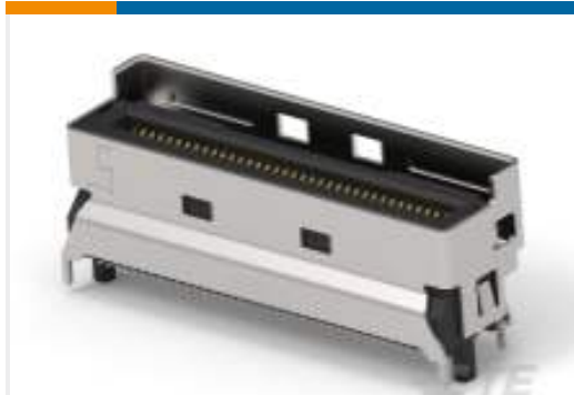
TE Part #2359366-5 MCIO INTERGRATED CONN, V/T,8X, SMT TYPE