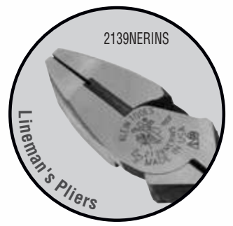
46% greater leverage Sure-gripping cross-hatched knurled jaws