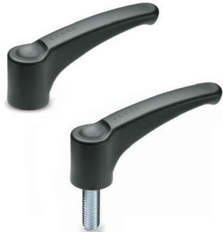
ERGOSTYLE® ELESA Original design