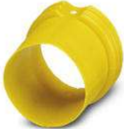
The illustration shows version WR-OEF-PG 21

Opener for corrugated tube, to disassemble corrugated tube screw connection, size Pg29